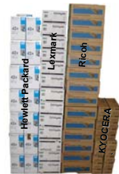
Drucker Channel 2005