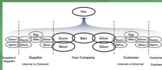
Supply Chain Operations Reference Model